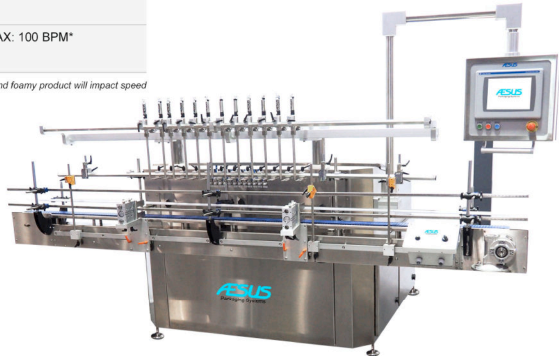
Photo: AF12 Aesus filler with 12 pumps and nozzles

*bottle shape, glass bottles and foamy product will impact speed